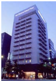
Shin-Yokohama Kokusai Hotel