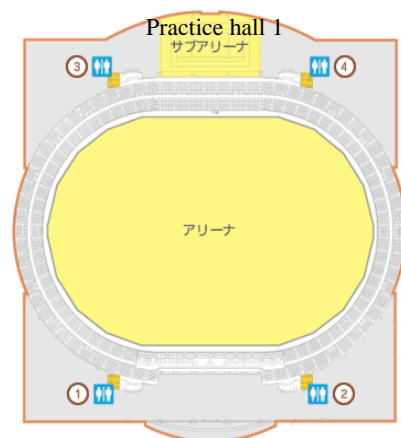
4 th floor plan