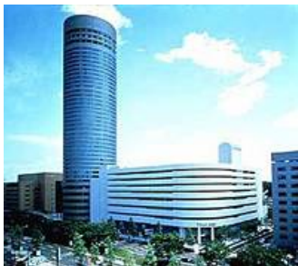
Shin-Yokohama Prince Hotel

Website: http://www.daiwaroynet.jp/english/index.html