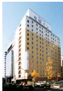
Toyoko Inn Shin-Yokohama