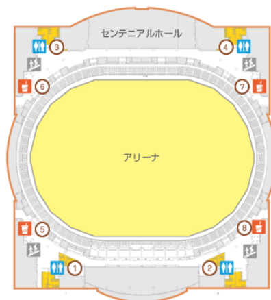
3 rd floor plan