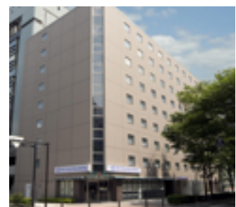
Daiwa Roynet Hotel Shin-Yokohama

Players and officials who are listed on Associations' official entry forms but who are not entitled to free hospitality can be accommodated with the others and on the same basis, including meals, transport and admission, at a charge of Japanese yen 16,900 per person per day in a twin/double room or Japanese yen 19,000 per person per day in a single room. The same rates apply for days not covered by free hospitality. Full hospitality organized by the YOC could be arranged from 25 th April (starting with lunch) at the earliest and the latest until 6 th May (finishing with breakfast).