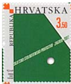
Above: Zagreb skyline, a blend of old & new. Left: Postage stamp issued for the event. A postcard & 2 postmarks were also issued.