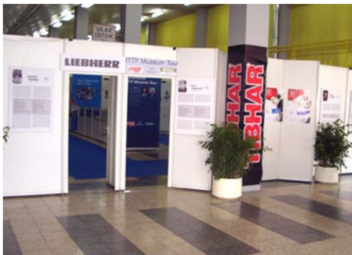
Below, clockwise top left: Exhibit entrance, with career highlights of top Croatian players; View of left aisle, entrance desk to theater; View of right aisle; and Crowds enjoying the exhibits. Dirtiest display case award (with most fingerprint smudges, a measure of exhibit popularity!): Ball evolution