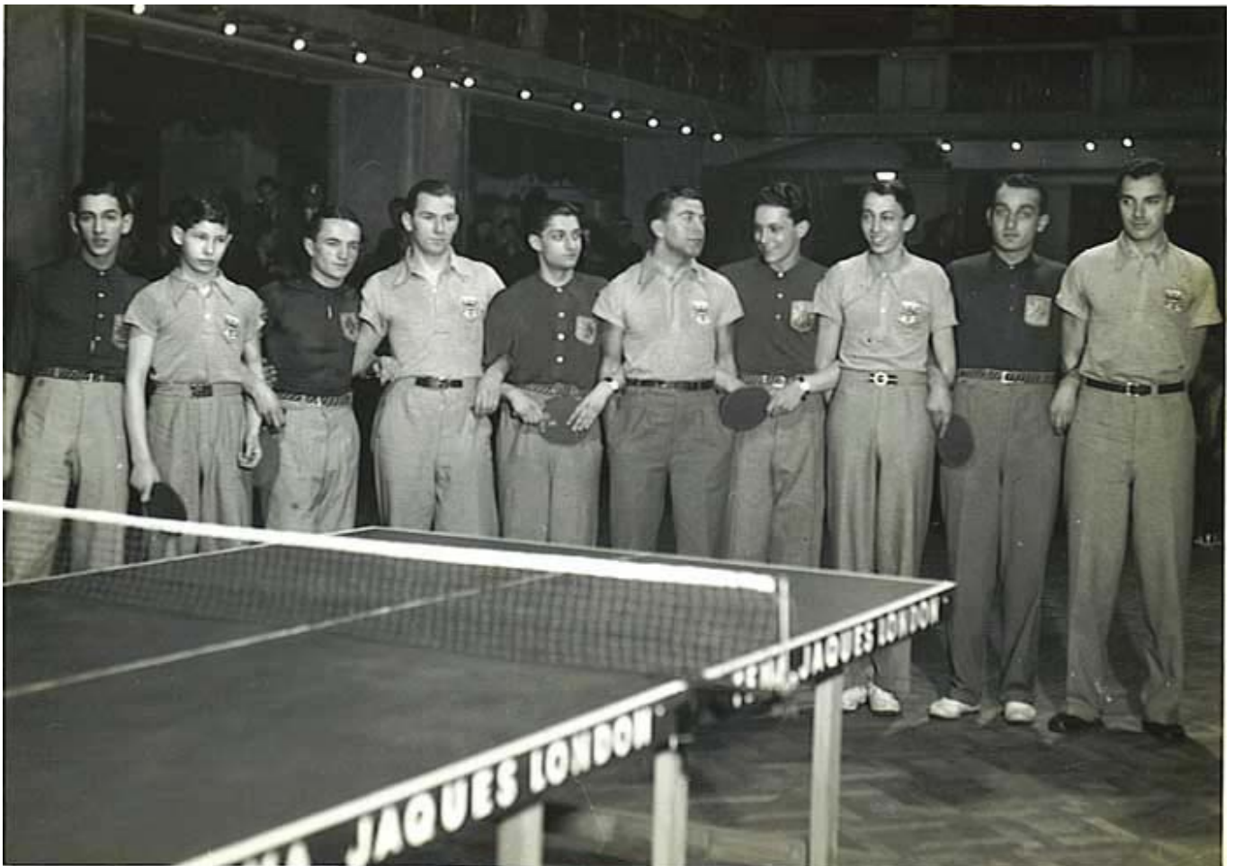
A rather remarkable photo of the 1936 Swaythling Cup men's team winners, Austria, linked arm-in-arm with the runners-up Romanian team. These days we seldom see such camaraderie ! Note the very young looking Richard Bergmann, second from the left.