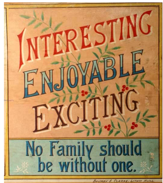
The 1890 game label - still true after 116 years!