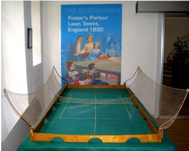
The only known example of the 1 st game of Table Tennis, made in 1890